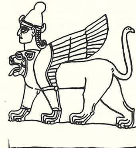
From "The Secret of the Hittites" (Knopf)

Fabulous beast, part man, part lion, from Carchemish, capital of Hittites.